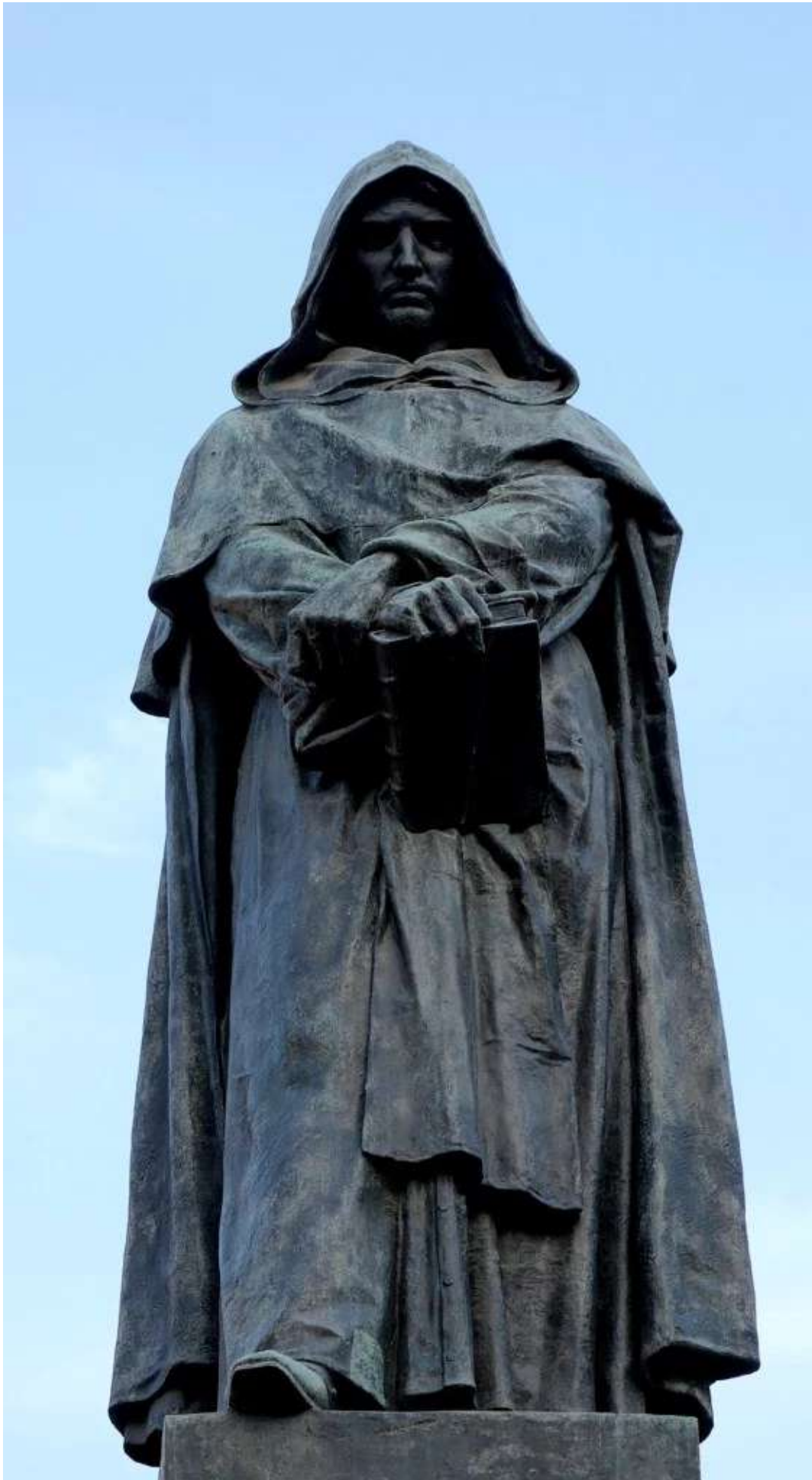
Giordano Bruno statue in the Campo de' Fiori